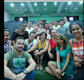
Scientific Students Group creation at the University of Havana: involving the students in Microbial Ecology research