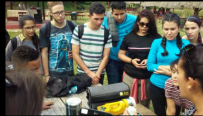
Air environmental monitoring