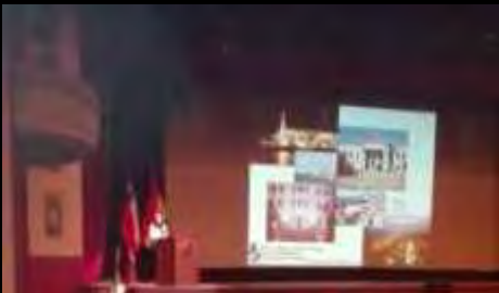
Cuban ambassador conference

1 st ISME – Latin America Congress presentations