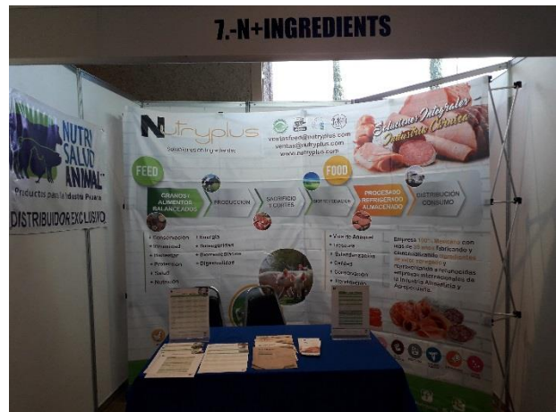
A view of some of the sponsors of this event