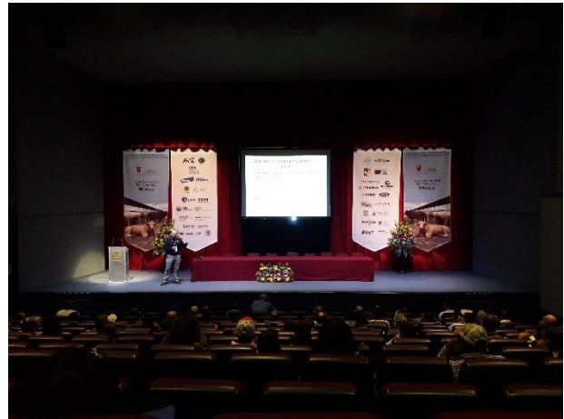
A total of 14 speakers gave their presentations to over 500 participants