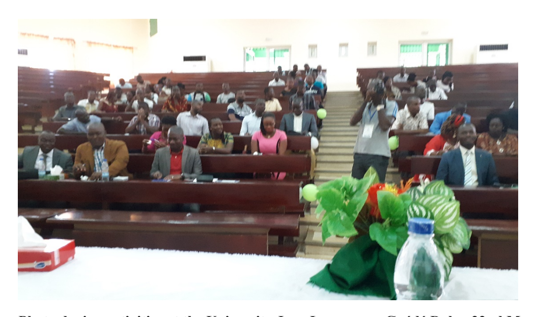
Photo during activities at the University Jean Lorougnon Guédé Daloa 22nd March 2019