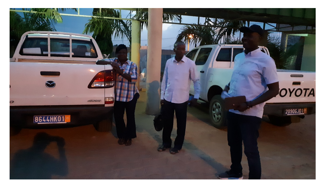
March 18th 2019: Arrival at the hotel in Korhogo from Abidjan