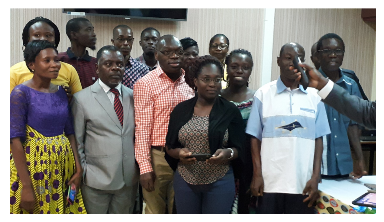
End of meeting at the Institut National Polytechnique Félix Houphouet Boigny Yamoussoukro March 21rst 2019