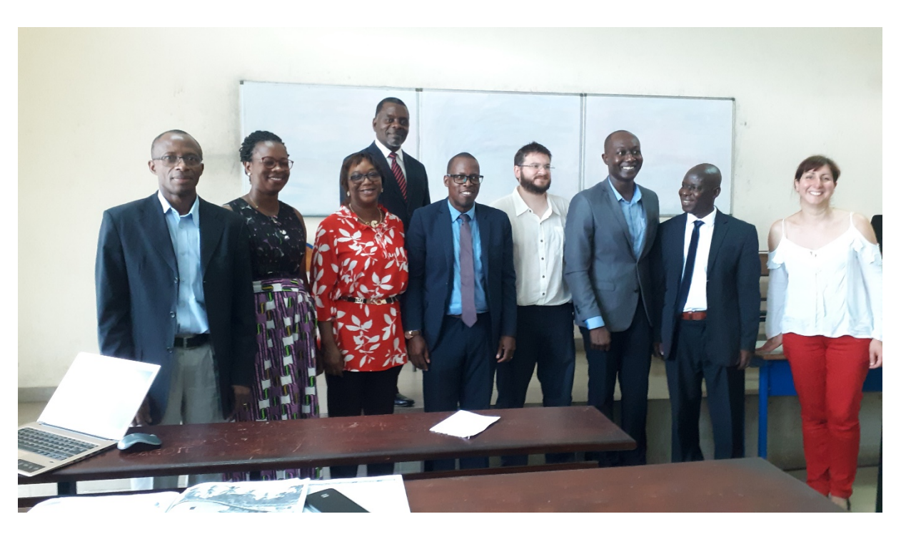
End of meeting, University Nangui Abrogoua, Abidjan