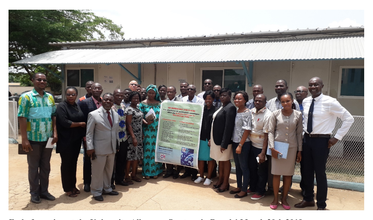
End of meeting at the University Allassane Ouatara in Bouaké March 20th 2019