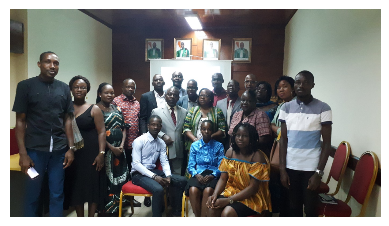
End of meeting, Faculty of Biosciens, University Félix Houphouet Boigny, Abidjan