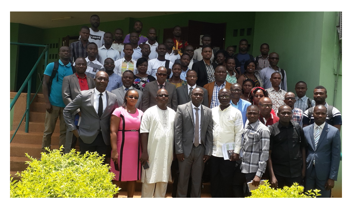
End of meeting, University Jean Lorougnon Guédé 22nd March 2019