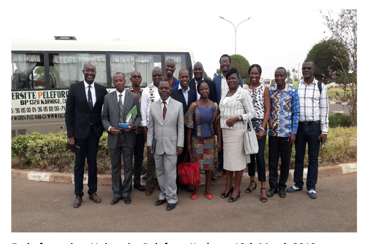
End of meeting, University Peleforo, Korhogo 19th March 2019