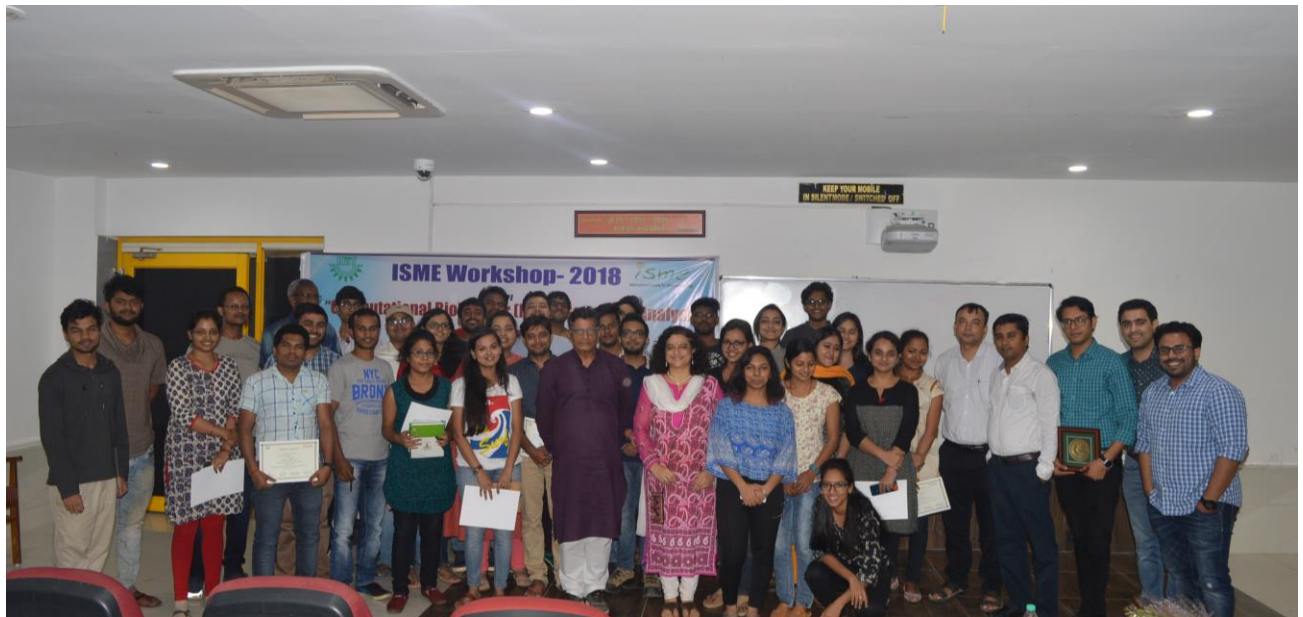
ISME Workshop at KIIT