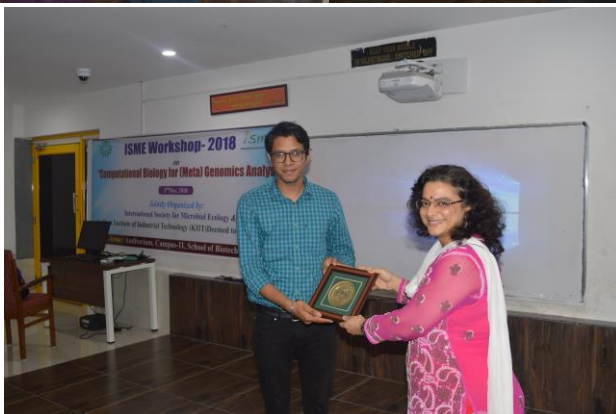
Felicitation of the Training Team